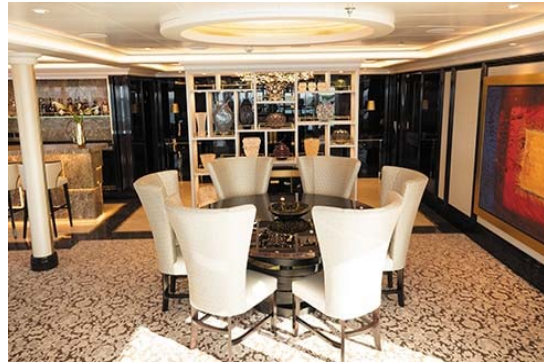
EXPLORER SUITE 76.3-85.3 SQM