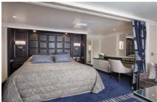
CONCIERGE SUITE 38.6-43.1 SQM