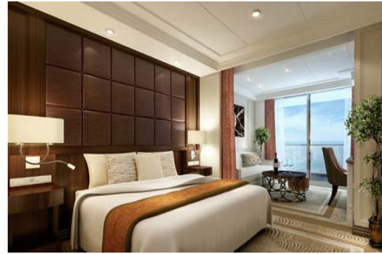
PENTHOUSE SUITE 52.1-58.2 SQM