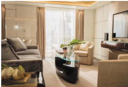
SEVEN SEAS SUITE 75.6 SQM