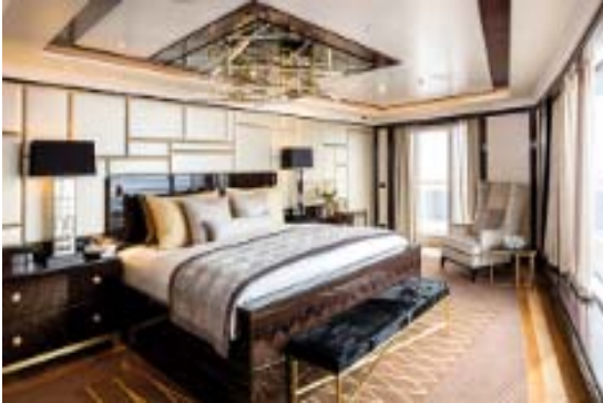
REGENT SUITE 412.8 SQM