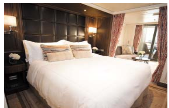
DELUXE VERANDA SUITE 31.7 SQM

*BOOK NOW* DECK 9: 061-451-9229, 082-651-8222