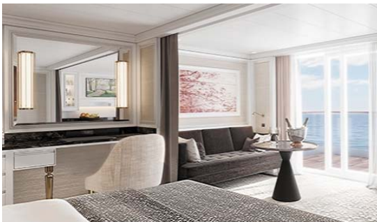
SUPERIOR SUITE – F 38.5 SQM.