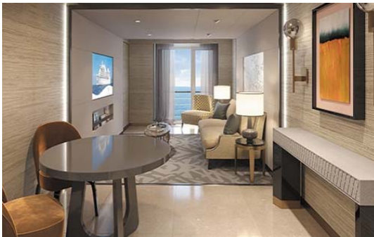
SPLENDOR SUITE – SP 76.2 SQM.