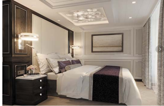
MASTER SUITE – MS 176 SQM.