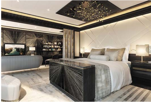
REGENT SUITE – RS 412 SQM

PENTHOUSE SUITES AND HIGHER INCLUDE: FREE Personal Butler and more