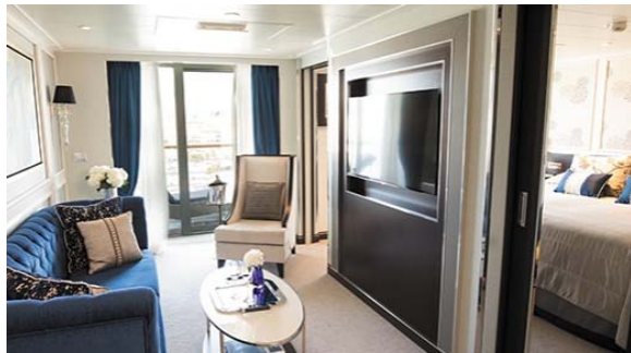
PENTHOUSE SUITE – A 52.1 SQM.