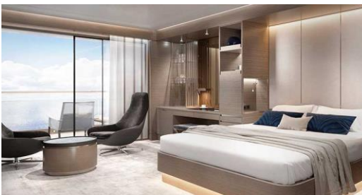
The Terrace Mid Suite (29+6 sqm.) Fares from $10,022