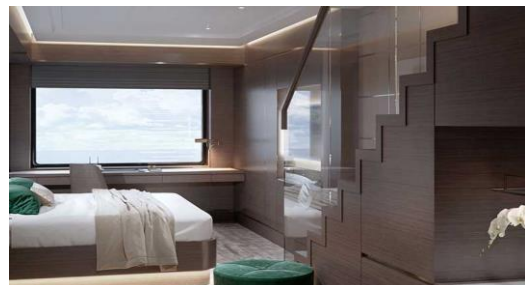
The Loft Suite (65+7 sqm.) Fares from $19,322