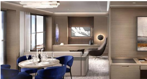
The Signature Mid Suite (44+9 sqm.) Fares from $16,322