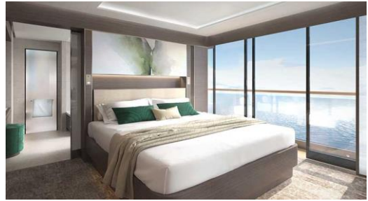
The View Suite (58+9 sqm.) Fares from $24,622