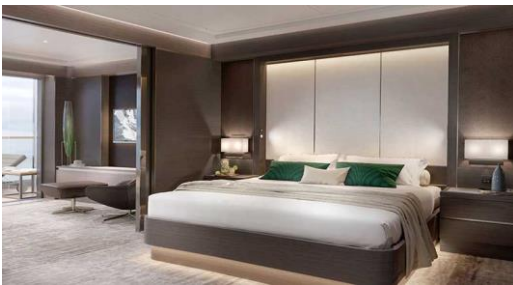
The Grand Suite (59+10 sqm.) Fares from $21,322