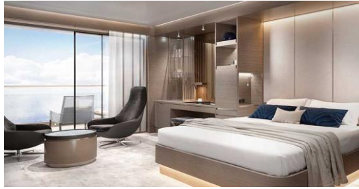
The Terrace Suite (29+6 sqm.) Fares from $9,622

Fares are per person based on double occupancy. Taxes, fees and port expenses of US$222 per passenger are included. Fares, taxes, and port charges are subject to change without notice. Deposit payment 25% of the cruise fare is required to confirm the booking. Guest cancellation schedule applies.