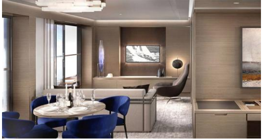
The Signature Suite (44+9 sqm.) Fares from $15,522