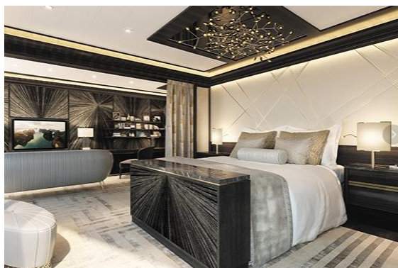
REGENT SUITE – RS 412 SQM

PENTHOUSE SUITES AND HIGHER INCLUDE: FREE Personal Butler and more