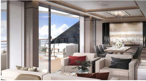
The Owners Suite (102+55 sqm.) Fares from $39,605