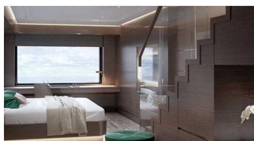
The Loft Suite (65+7 sqm.) Fares from $19,311