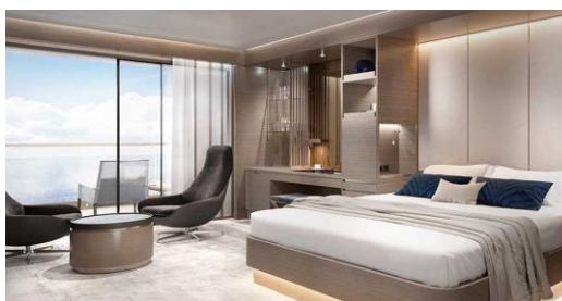
The Terrace Mid Suite (29+6 sqm.) Fares from $10,011