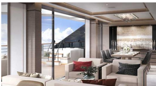
The Owners Suite (102+55 sqm.) Fully Booked